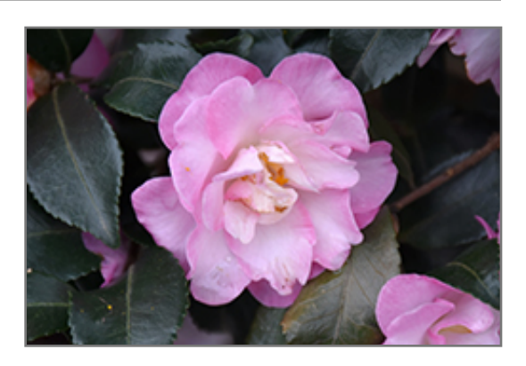
October Magic Orchid Camellia flowers