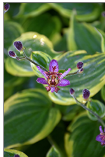
Autumn Glow Toad Lily flowers