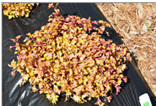
Wildfire Flash Coleus