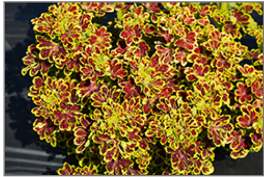
Tidbits Tammy Coleus foliage