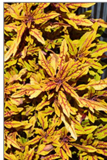
Hipsters Zooley Coleus foliage

Hipsters Zooley Coleus is recommended for the following landscape applications;