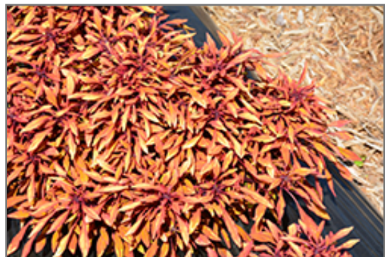
Fancy Feathers Copper Coleus