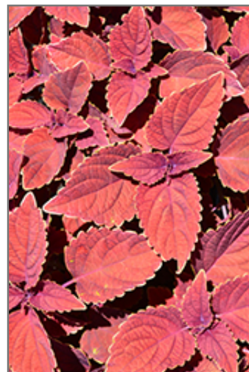
Color Clouds Valentine Coleus foliage

Color Clouds Valentine Coleus is recommended for the following landscape applications;