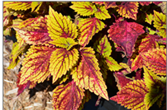
Color Clouds Hottie Coleus foliage