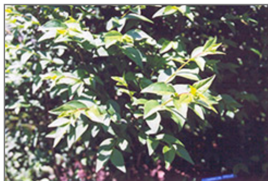
Common Privet foliage