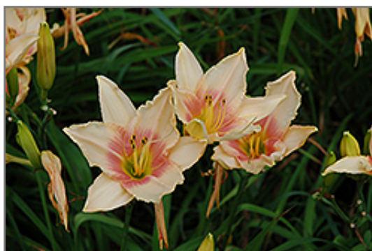
Broadmoor Delight Daylily flowers