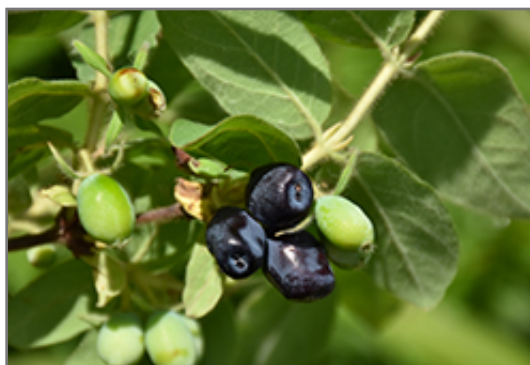
Indigo Gem Honeyberry fruit