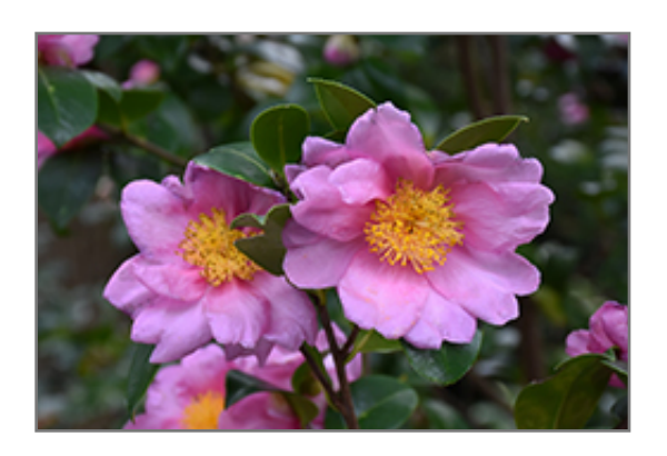
Autumn Pink Icicle Camellia flowers

Autumn Pink Icicle Camellia will grow to be about 8 feet tall at maturity, with a spread of 5 feet. It has a low canopy with a typical clearance of 1 foot from the ground, and is suitable for planting under power lines. It grows at a medium rate, and under ideal conditions can be expected to live for 40 years or more.