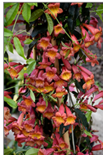
Tangerine Beauty Cross Vine flowers

Tangerine Beauty Cross Vine is recommended for the following landscape applications;