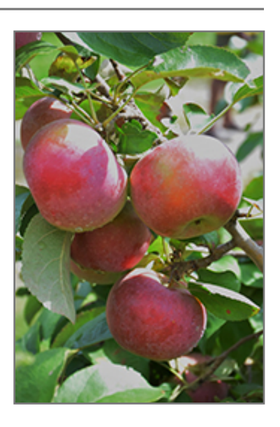
Idared Apple fruit

Aside from its primary use as an edible, Idared Apple is sutiable for the following landscape applications;