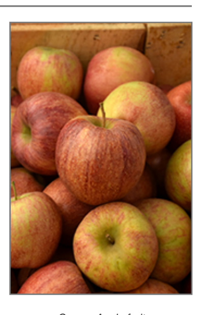
Cameo Apple fruit

Aside from its primary use as an edible, Cameo Apple is sutiable for the following landscape applications;