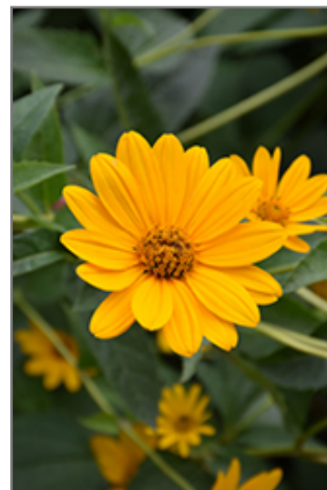
False Sunflower flowers

False Sunflower is recommended for the following landscape applications;