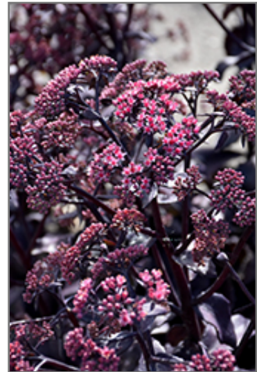
Cherry Truffle Stonecrop flowers

This is a relatively low maintenance plant, and is best cleaned up in early spring before it resumes active growth for the season. It is a good choice for attracting bees and butterflies to your yard, but is not particularly attractive to deer who tend to leave it alone in favor of tastier treats. It has no significant negative characteristics.