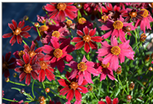
Bloomsation Dragon Tickseed flowers