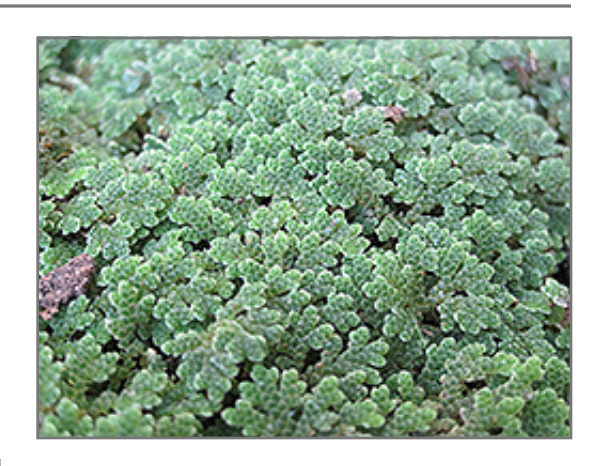
Mosquito Fern foliage

This is a relatively low maintenance plant, and may require the occasional pruning to look its best. It has no significant negative characteristics.