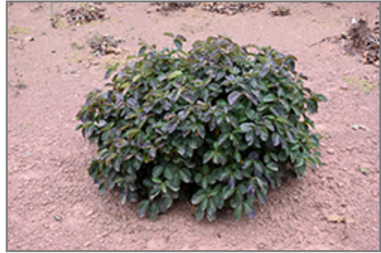
C.A. Hildebrant's Viburnum in fall

C.A. Hildebrant's Viburnum is recommended for the following landscape applications;