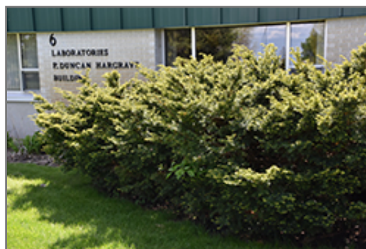
Morden Japanese Yew