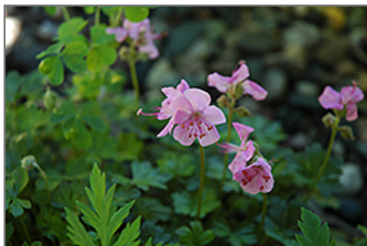
Claridge Druce Cranesbill flowers

Claridge Druce Cranesbill is recommended for the following landscape applications;