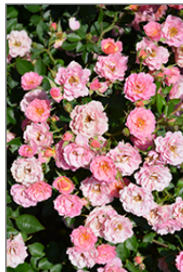
Oso Easy Petit Pink flowers