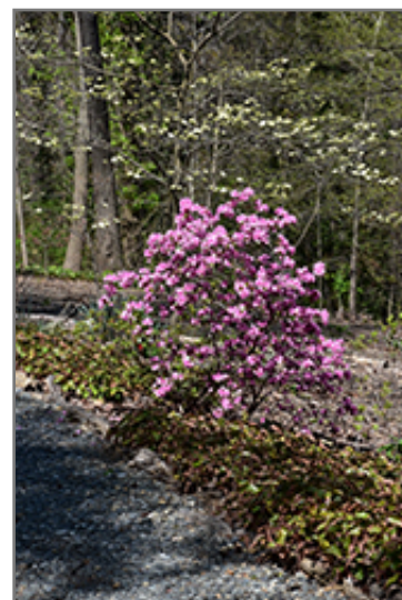
Little Olga Rhododendron in bloom