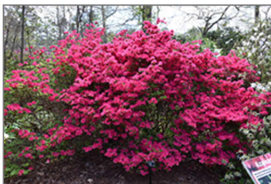
Hinode-giri Azalea in bloom