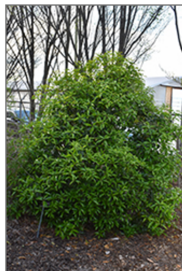
Apricot Gold Fragrant Tea Olive