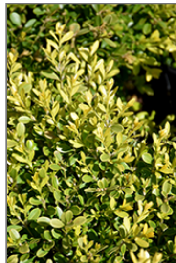
Tide Hill Boxwood foliage