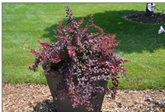
Sunjoy Syrah Japanese Barberry in bloom