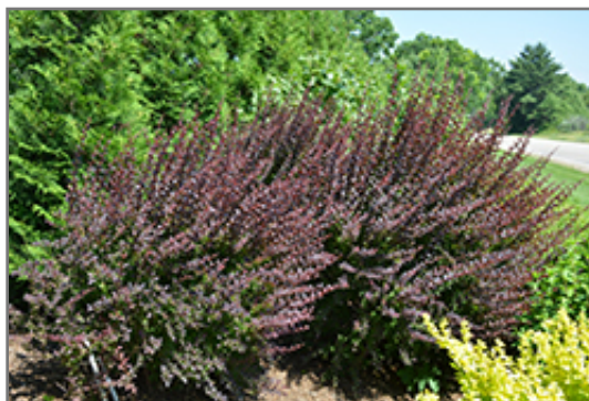
Sunjoy Syrah Japanese Barberry