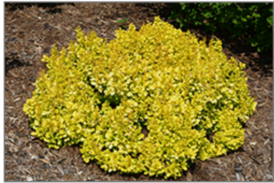
Sunjoy Mini Saffron Japanese Barberry