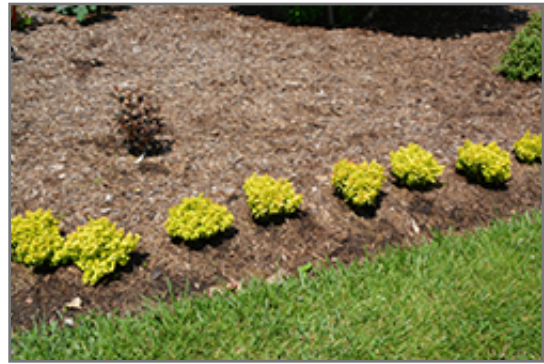
Sunjoy Mini Saffron Japanese Barberry (pruned as hedge)

This shrub does best in full sun to partial shade. It is very adaptable to both dry and moist growing conditions, but will not tolerate any standing water. It is not particular as to soil type or pH, and is able to handle environmental salt. It is highly tolerant of urban pollution and will even thrive in inner city environments. This is a selected variety of a species not originally from North America.