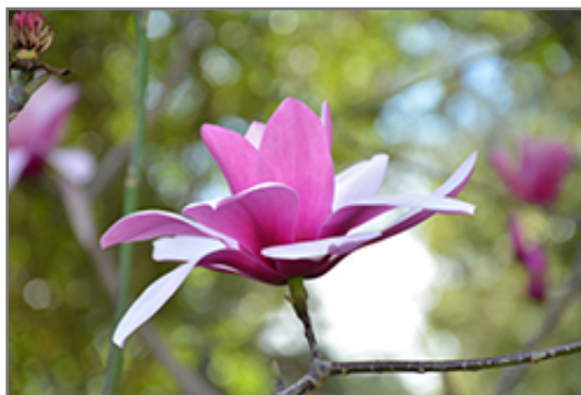
Dawson's Magnolia flowers