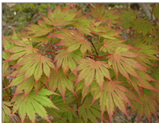
Sensu Full Moon Maple foliage