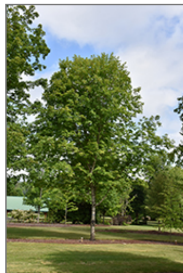
John Pair Sugar Maple