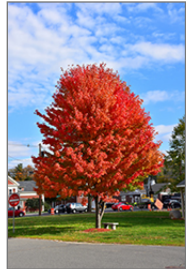
Autumn Splendor Sugar Maple in fall