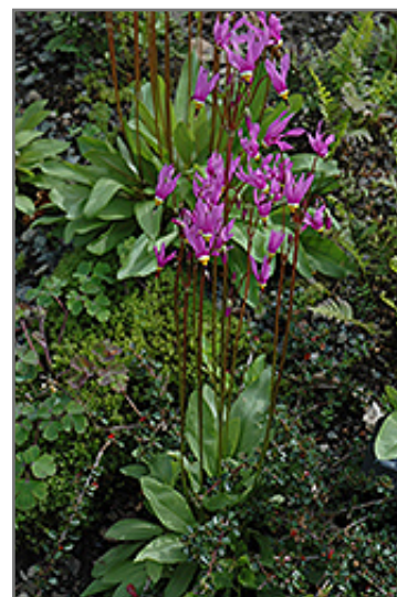
Shooting Star in bloom