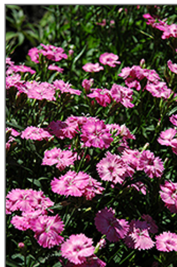
Blue Hills Pinks flowers