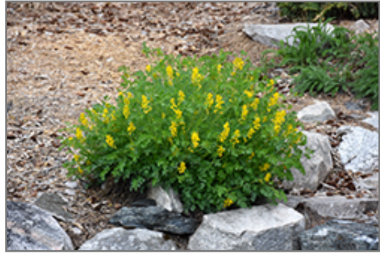
Golden Corydalis in bloom

This plant does best in partial shade to shade. It prefers to grow in average to moist conditions, and shouldn't be allowed to dry out. It is not particular as to soil type or pH. It is quite intolerant of urban pollution, therefore inner city or urban streetside plantings are best avoided, and will benefit from being planted in a relatively sheltered location. Consider applying a thick mulch around the root zone in winter to protect it in exposed locations or colder microclimates. This species is not originally from North America.