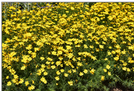
Golden Showers Tickseed in bloom