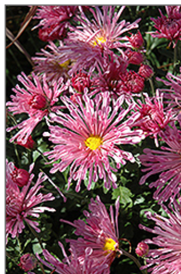
Centerpiece Chrysanthemum flowers