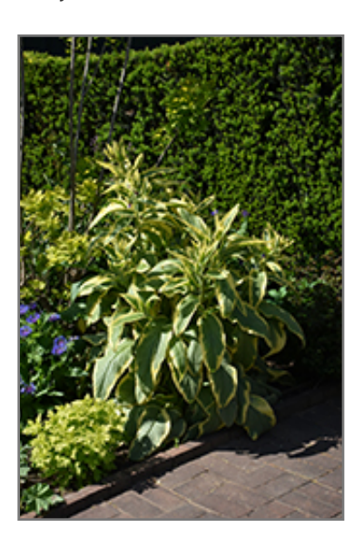
Axminster Gold Russian Comfrey

This is a high maintenance plant that will require regular care and upkeep, and should be cut back in late fall in preparation for winter. Deer don't particularly care for this plant and will usually leave it alone in favor of tastier treats. It has no significant negative characteristics.