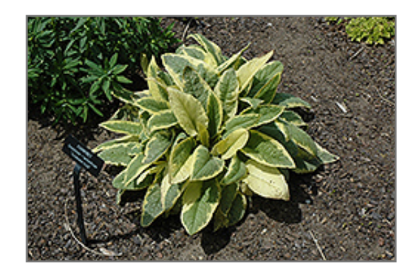
Axminster Gold Russian Comfrey

Axminster Gold Russian Comfrey is an herbaceous perennial with tall flower stalks held atop a low mound of foliage. Its medium texture blends into the garden, but can always be balanced by a couple of finer or coarser plants for an effective composition.