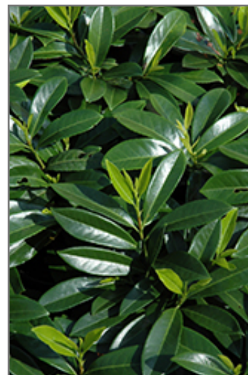
Mount Vernon Laurel foliage

Mount Vernon Laurel will grow to be about 12 inches tall at maturity, with a spread of 7 feet. It tends to fill out right to the ground and therefore doesn't necessarily require facer plants in front. It grows at a medium rate, and under ideal conditions can be expected to live for 50 years or more.