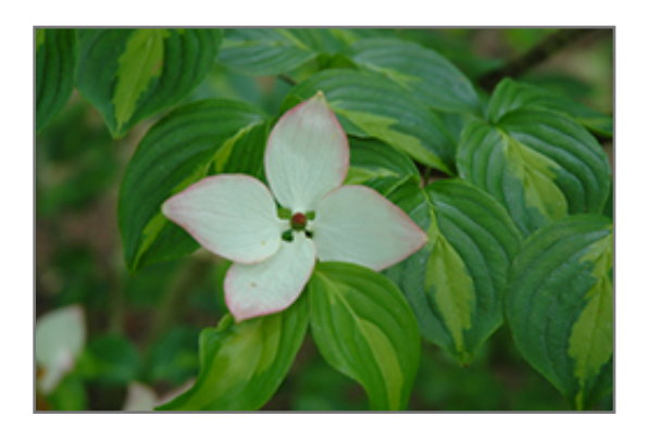
Gold Cup Chinese Dogwood flowers