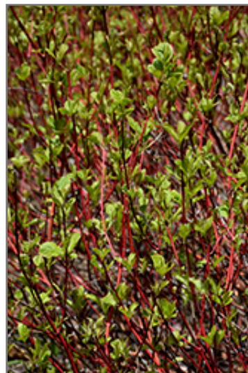
Westonbirt Dogwood stems