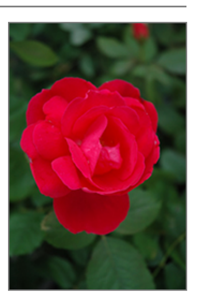
Morden Cardinette Rose flowers

Morden Cardinette Rose will grow to be about 24 inches tall at maturity, with a spread of 24 inches. It tends to fill out right to the ground and therefore doesn't necessarily require facer plants in front. It grows at a fast rate, and under ideal conditions can be expected to live for approximately 20 years.