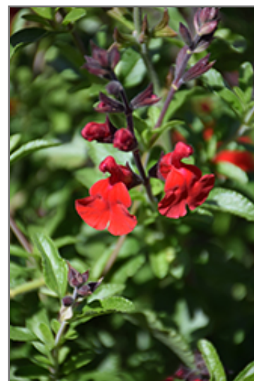
Radio Red Autumn Sage flowers