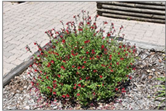
Radio Red Autumn Sage in bloom

Radio Red Autumn Sage will grow to be about 14 inches tall at maturity, with a spread of 16 inches. When grown in masses or used as a bedding plant, individual plants should be spaced approximately 12 inches apart. It grows at a medium rate, and under ideal conditions can be expected to live for approximately 5 years. As an evergreen perennial, this plant will typically keep its form and foliage year-round.