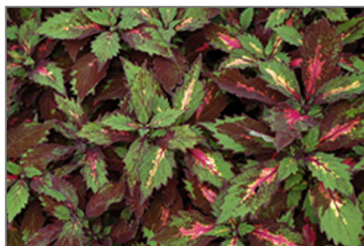
Marquee Special Effects Coleus foliage