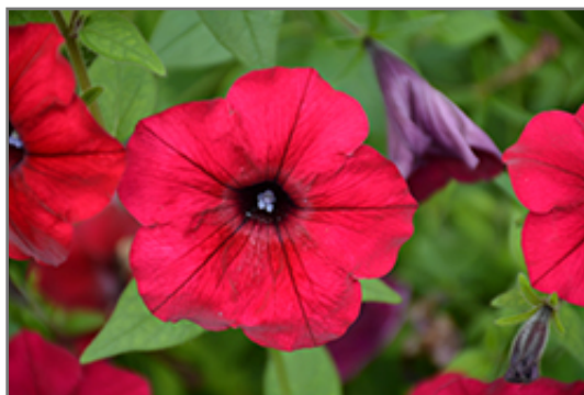
Tidal Wave Red Velour Petunia flowers