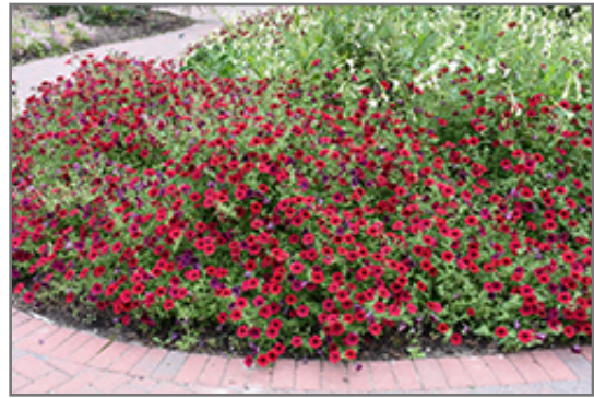
Tidal Wave Red Velour Petunia in bloom

Tidal Wave Red Velour Petunia is a fine choice for the garden, but it is also a good selection for planting in outdoor containers and hanging baskets. Because of its trailing habit of growth, it is ideally suited for use as a 'spiller' in the 'spiller-thriller-filler' container combination; plant it near the edges where it can spill gracefully over the pot. Note that when growing plants in outdoor containers and baskets, they may require more frequent waterings than they would in the yard or garden.