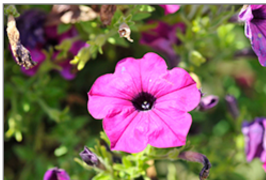
Success! Violet Petunia flowers