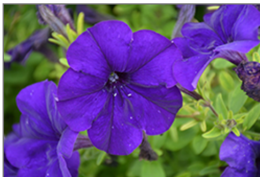
Success! Blue Petunia flowers