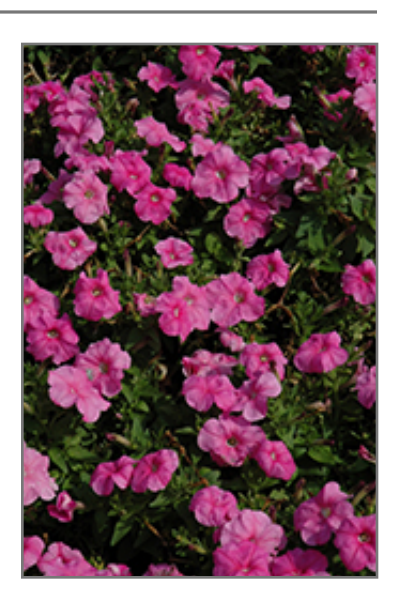
Mambo GP Sweet Pink Petunia flowers

Mambo GP Sweet Pink Petunia will grow to be about 8 inches tall at maturity, with a spread of 12 inches. When grown in masses or used as a bedding plant, individual plants should be spaced approximately 10 inches apart. Its foliage tends to remain low and dense right to the ground. This fast-growing annual will normally live for one full growing season, needing replacement the following year.