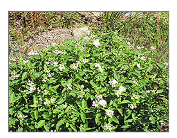
White Lightnin' Trailing Lantana in bloom

White Lightnin' Trailing Lantana is recommended for the following landscape applications;